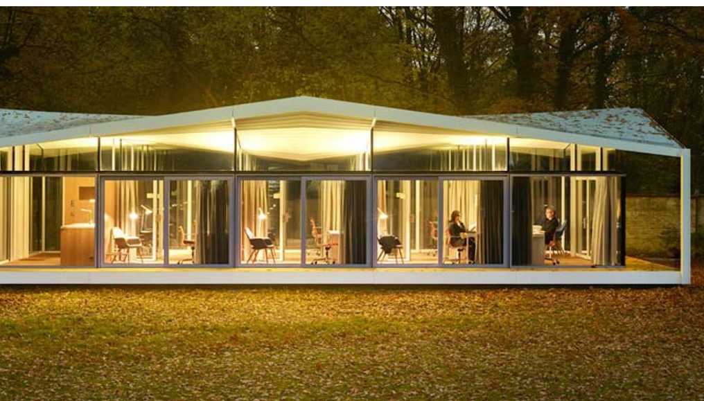
The American Academy in Berlin.